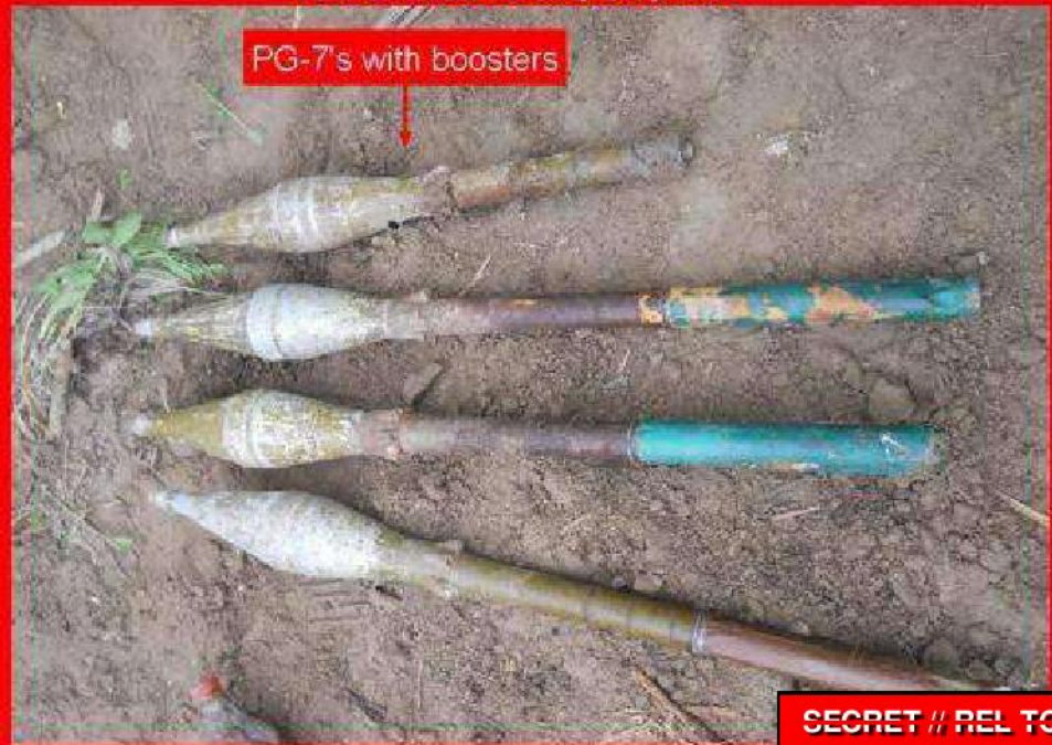
PG-7's with boosters