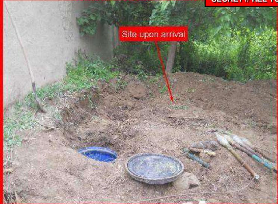
Site upon arrival