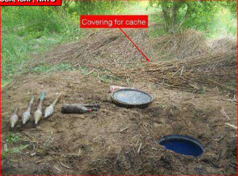
Covering for cache