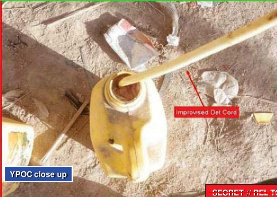
YPOC close up