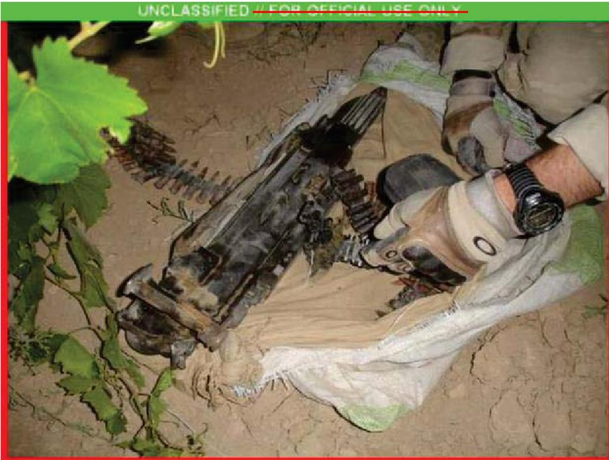
USSR, SG-43 Goryunov