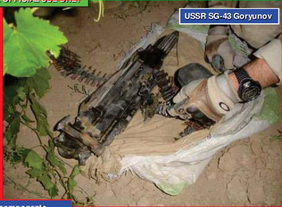
Overview of components.