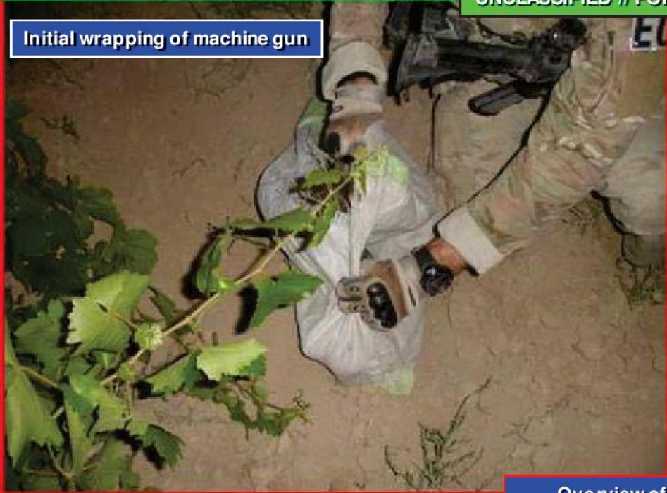
Initial wrapping of machine gun