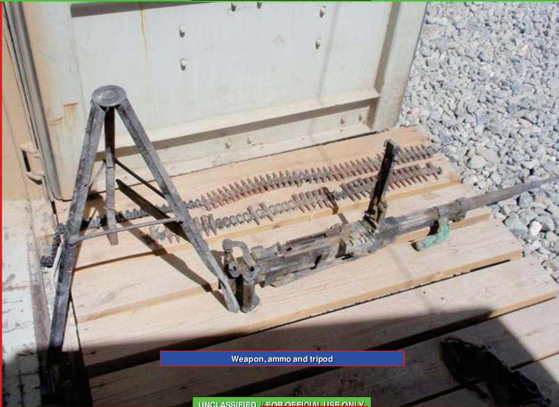
Weapon, ammo and tripod