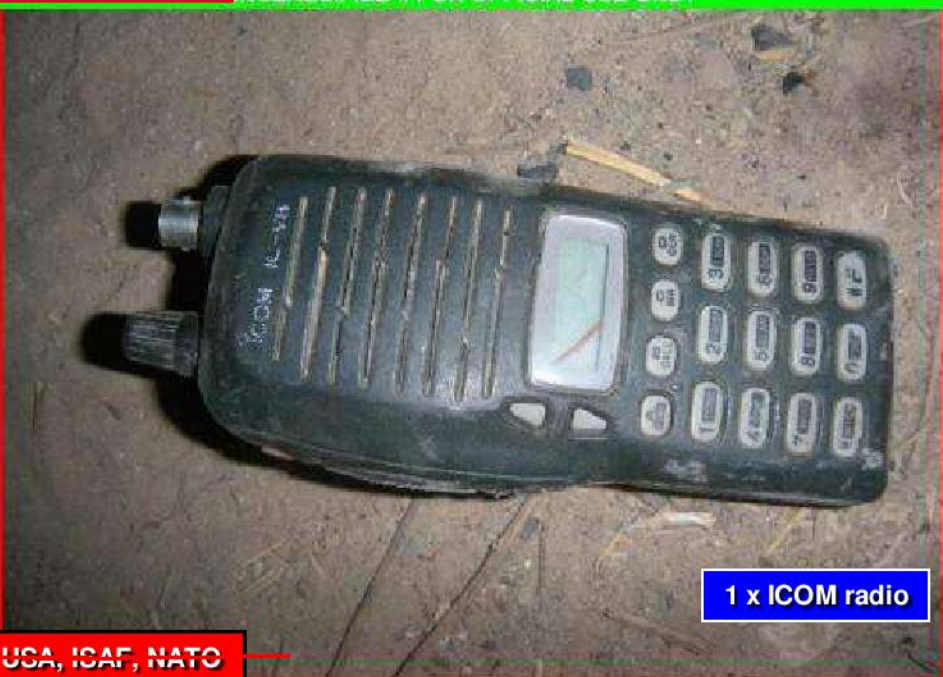
1 x ICOM radio