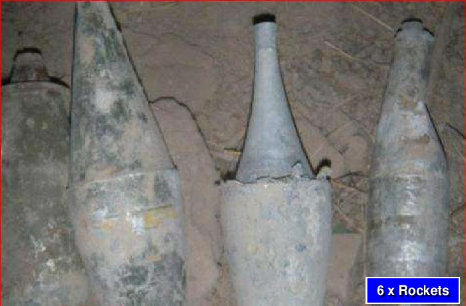
6 x Rockets