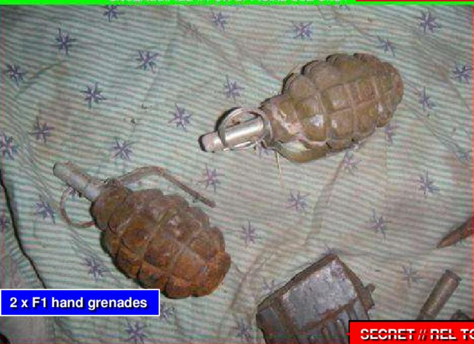
2 x F1 hand grenades