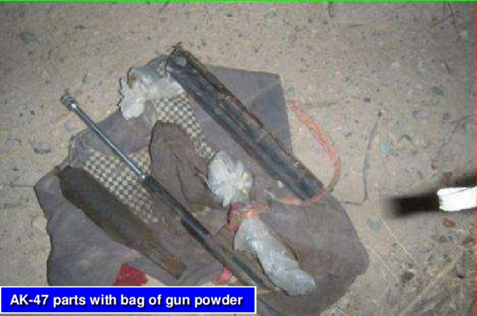
AK-47 parts with bag of gun powder