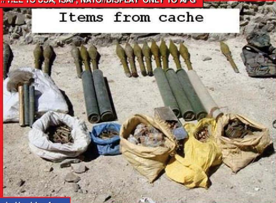
Items from cache