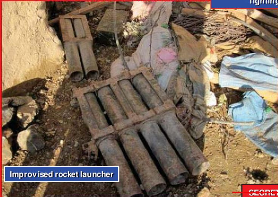
Improvised rocket launcher