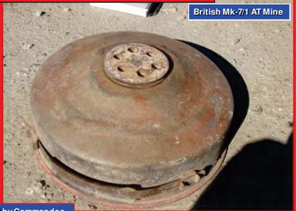
Landmine found by Commandos at the RON site